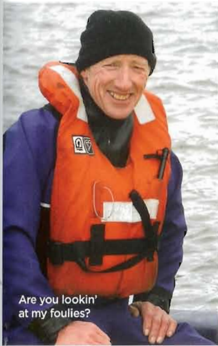
Are you lookin' at my foulies?

She looks fast too, even at rest. Her tubes sit quite high, elevated from the water's surface and, while that does little for stability when you make your way around the stationary boat, it suggests that the tubes will keep out of the way until called into service to steady a turn or to provide buoyancy and stability under a heavy load. Both in terms of efficiency and practicality, that's precisely what you want. ➤